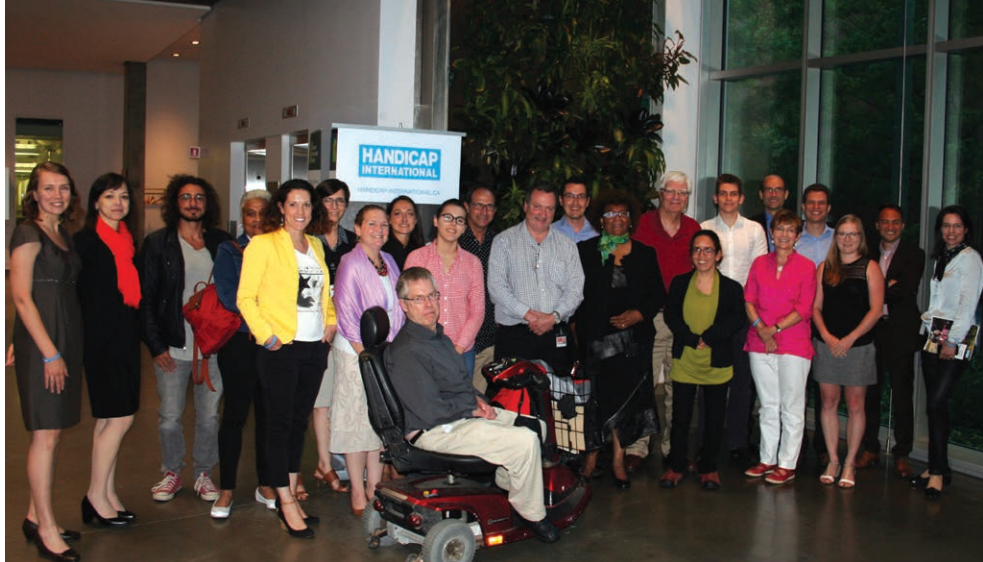
PHOTO: HANDICAP INTERNATIONAL'S GENERAL ASSEMBLY AT THE MONTREAL HEADQUARTERS ON JUNE 3 RD , 2016

It is never easy to comment a year that has been over for quite a while, but, nevertheless, it is an opportunity to look back on continuous events where - especially in our sector of international aid - news keeps rolling in and, unfortunately, humanitarian crises are multiplying and worsening.